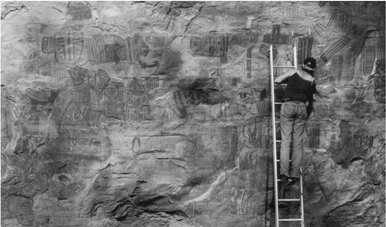
Lapa do Cobaclo: the different moments of São Francisco tradition painted over ancient anthropomorphic picture