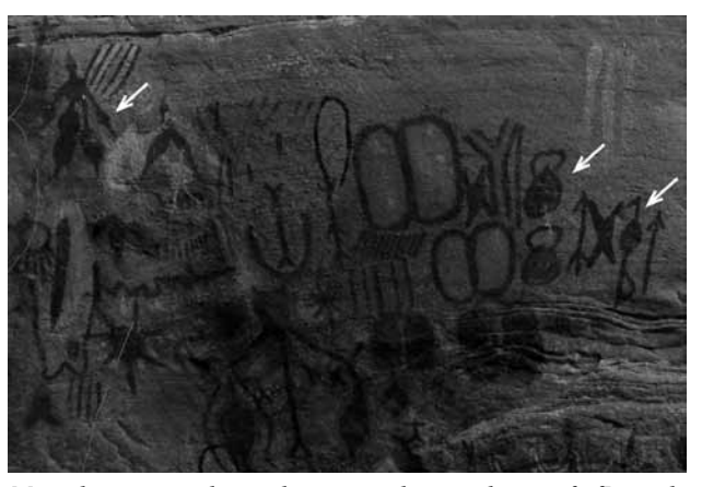
Montalvânia complex exclusive panel over a low roof ofLapa do Tikão