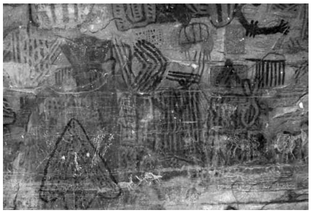
The Montalvânia complex paintings among the geometric pictures of São Francisco tradition