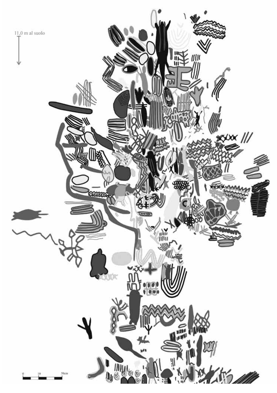
Final composition of a panel at lapa dos Desenhos (Peruaçu valley, Minas Gerais), composed by the four moments of São Francisco tradition and the Montalvânia complex